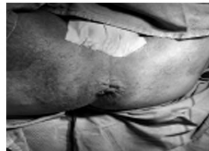
Fig. (3): After excision of mother piles (3, 7, 11) using harmonic scalpel.

Harmonic scalpel group: In harmonic scalpel hemorrhoidectomy, excision of hemorrhoids was done with the help of vascular forceps and without damaging the internal anal sphincter. The hemorrhoidal pedicle were coagulated with a harmonic scalpel without ligation of the pedicle.