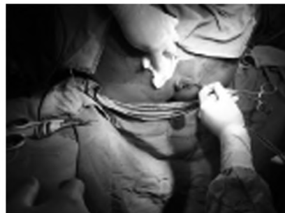
Fig. (2): During the procedure of harmonic hemorrhoidectomy.