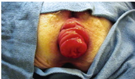
Fig. (1): Shows patient with complete rectal prolapse.

repair of the rectocele, as well as prolapse. The proximal end of the mesh is anchored to the sacral promontory with sutures or tacks. The pelvic peritoneum is then approximated to extraperitonealize the mesh closed by absorbable sutures and the port site wounds were closed using subcuticular sutures.