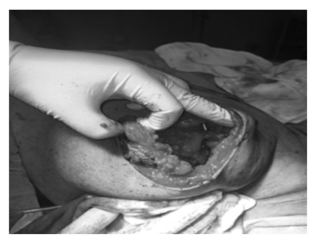
Fig. (4): Excision of the mass and clipping of operative bed for post-operative radiotherapy.