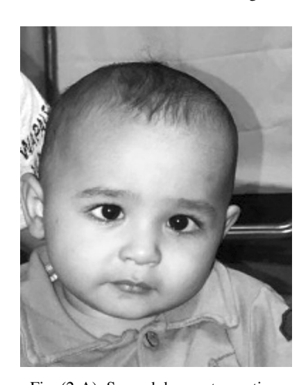
Fig. (2-A): Second day postoperative.