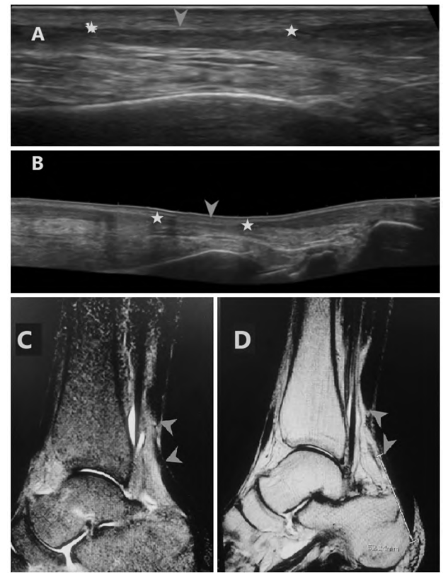
Fig. (2): Longitudinal (A) and panoramic (B) views of AT in A 40 years old male patient complains of acute ankle pain after twisting his ankle accidentally, AT showing full thickness tear of the mid segment (stars) with gapping (arrows), the cut edges are thickened with hypo-echoic texture. MRI, STIR-Sagittal (C) and T2WI sagittal (D) showing full thickness tear of the AT with gapping (arrows).